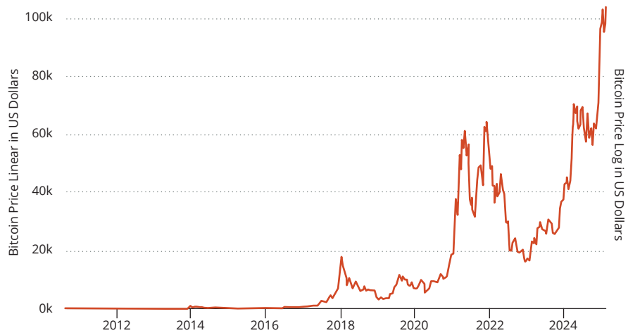
Chart 1: Bitcoin's price volatility has become more visibly extreme since 2018 Bitcoin prices (USD): 9 August 2010 – 10 February 2025

As at 10 February 2025